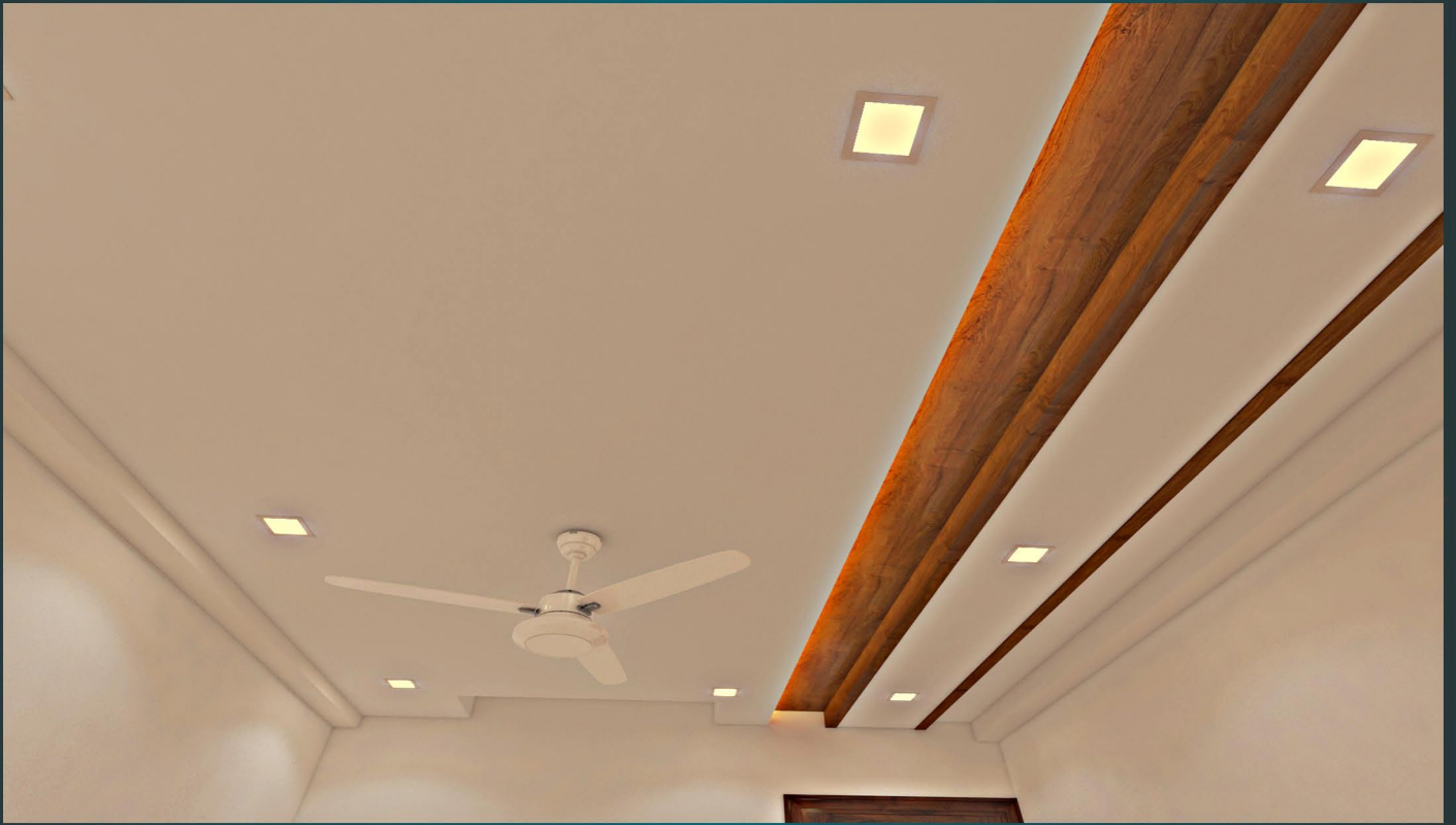
Bedroom 3- 14'6" X 10'9"